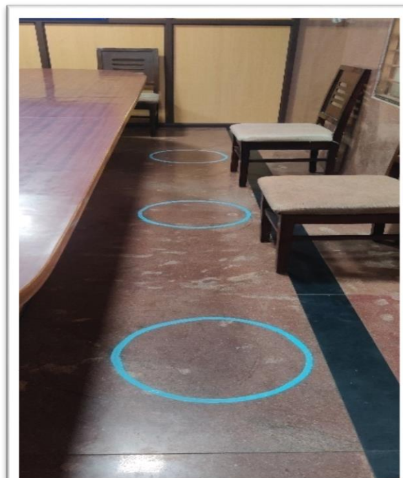
Social distance marking