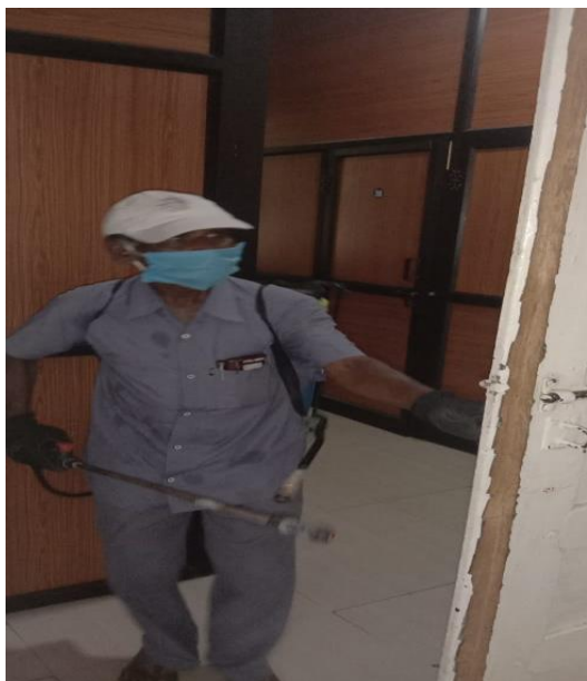
Disinfection by HI/Dept.