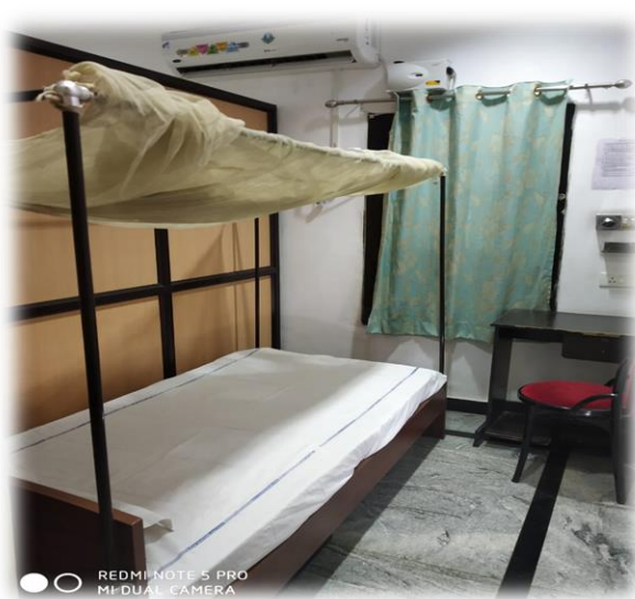
SINGLE BED CUBICLE