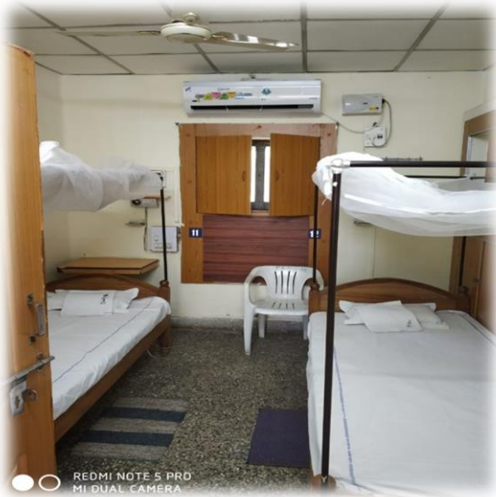
DOUBLE BED ROOM