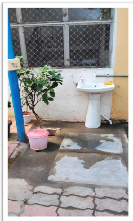
Provision of Hand Wash