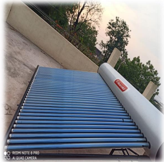
HOT WATER SOLAR PANEL