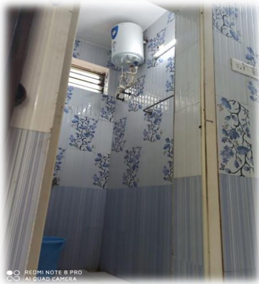
HOT WATER GEYSER