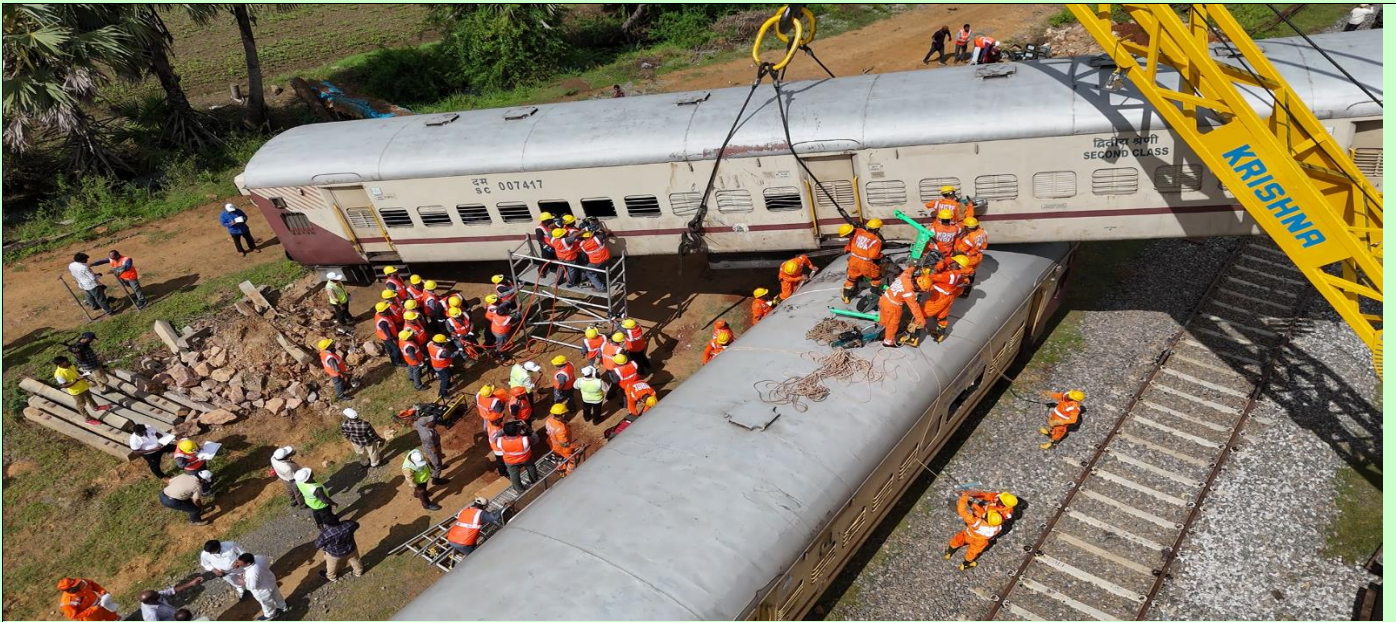
Cutting of coach roof for rescuing passenger