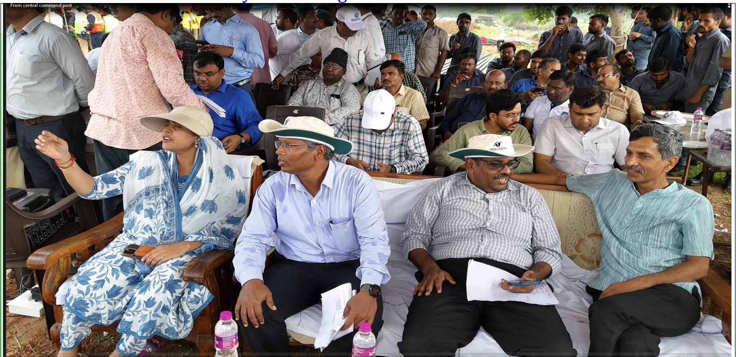
PCSO/SC, DRM/GNT & Sr.DSO controlling the situation from central command post at VJA.

Conducted mock exercise at regular intervals simulating conditions of passenger train involved in accident followed by monitoring of relief and restoration activities