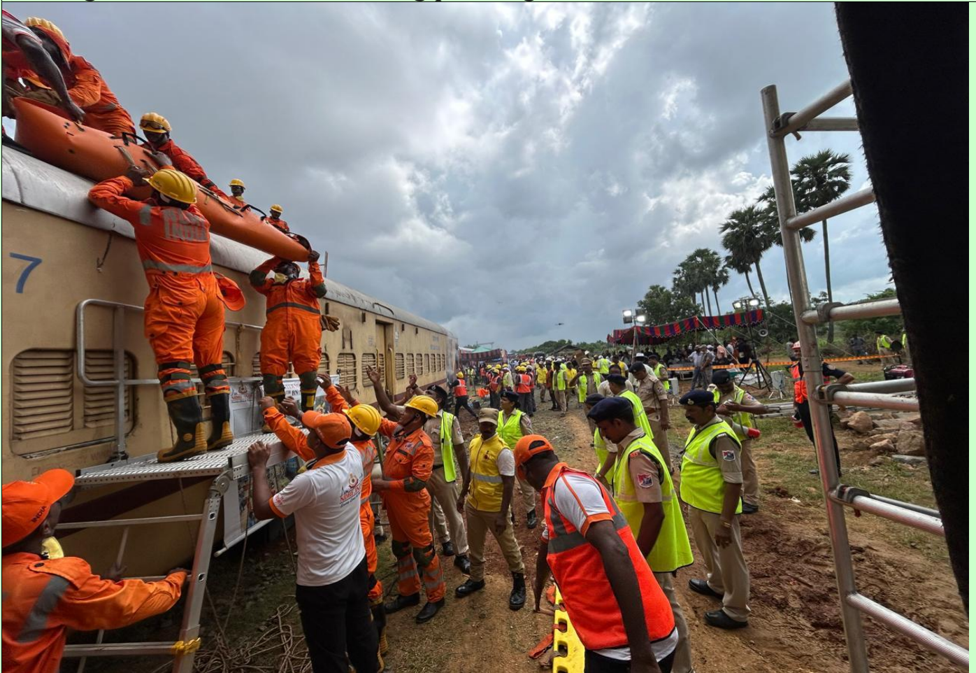
Rescuing passengers from roof of the coach