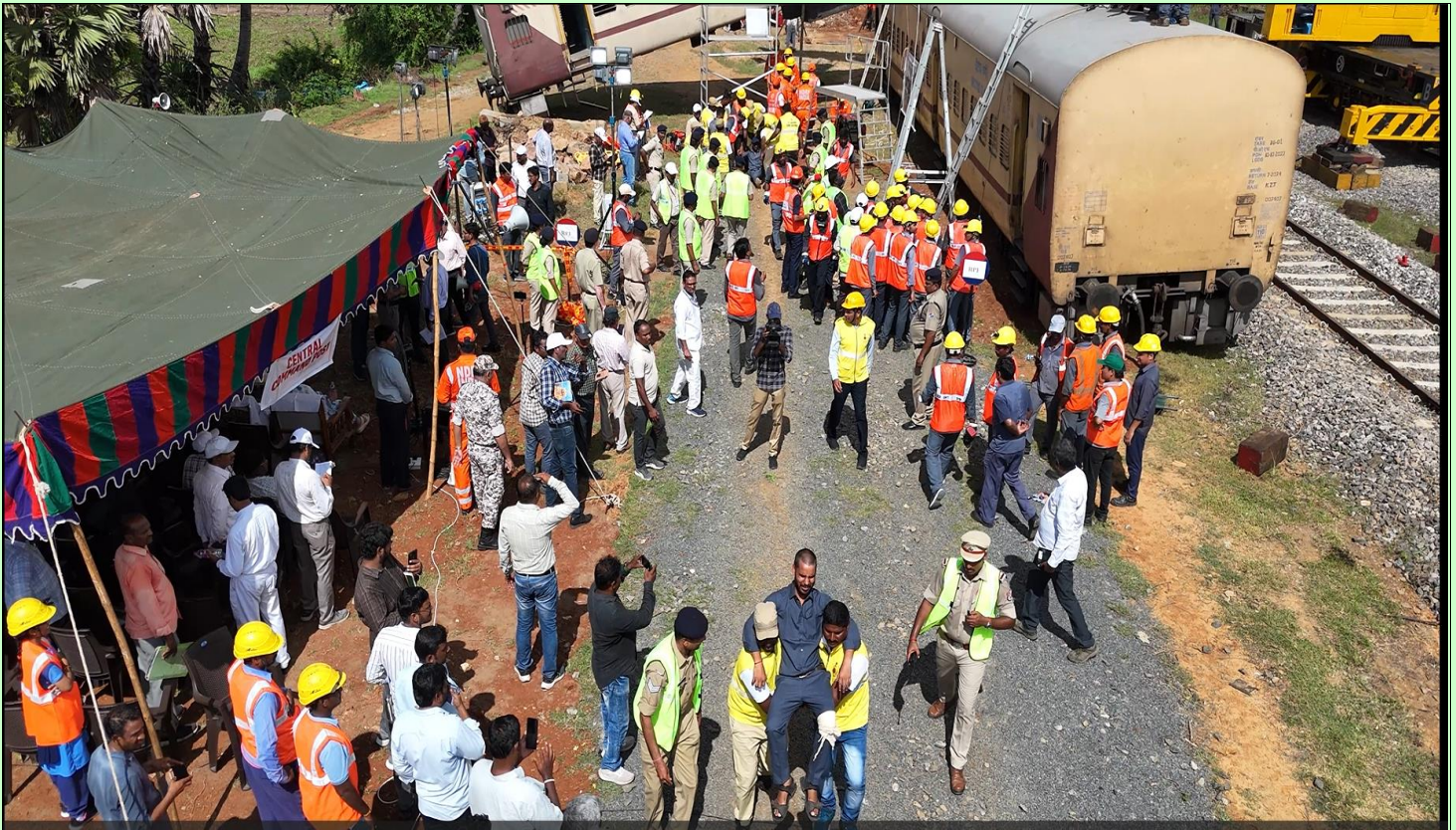
Rescuing trapped passengers from coaches