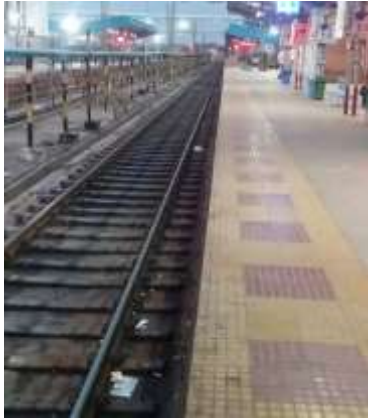
Before cleaning at AWB Station