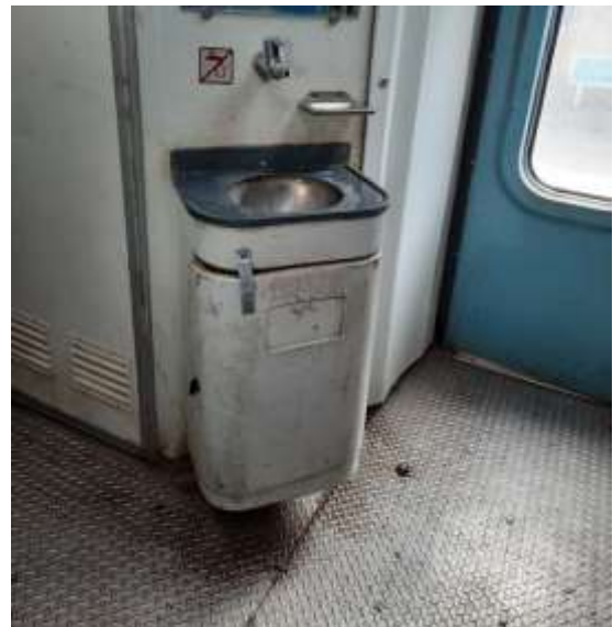
T.No. 12715/16 After cleaning