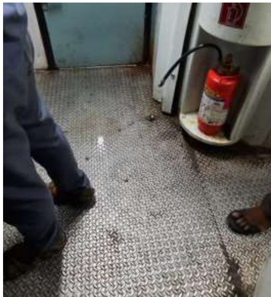
T.No. 12715/16 Before cleaning