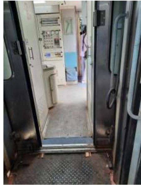
T.No. 12715 After cleaning

Swachhta Pakhwara program conducted by DY.CME/WS, DME/C&W and C&W staff participated and check the Suchkhand Exp. At pit line