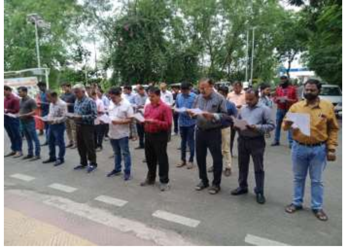
DRM/NED,BO'S & Employees Swachhta Pledge at DRM office NED on 16.09.2022