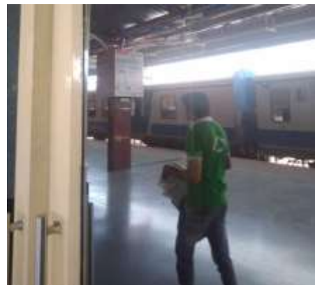
After cleaning at Nanded station

Swachh Parisar at AURANGABAD station conducted by CHI/AWB, SM/AWB and other staff