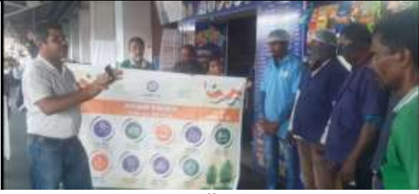
CHI/NED interact with canteen staff and given suggestion about hygiene & sanitation and upkeep of railway stations