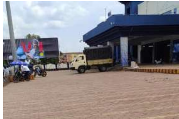
After cleaning at JALNA station area