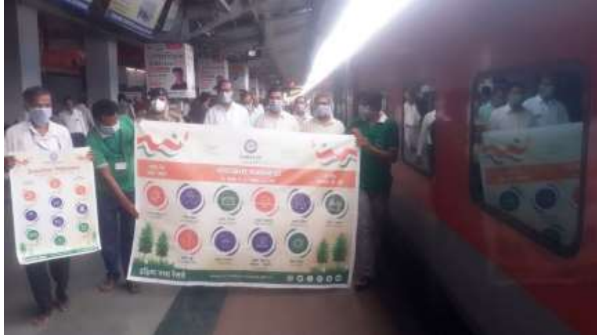
Prabhat pheri with slogan on "Swachh Train" into the Swachhata Pakhwada at NANDED Station

Awareness about uses of Bio Toilets and spread of No-Plastic use. CHI/NED,SM/NED,RPF and other staff participated