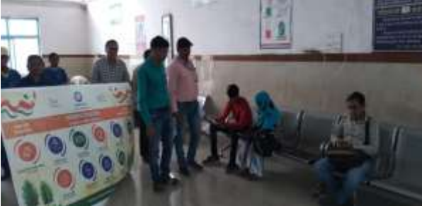
CHI/AWB ,CCI/AWB and staff interact with canteen staff and given suggestion about hygiene & sanitation and upkeep of railway stations