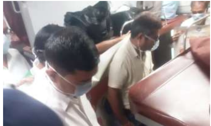
"Swachh Train" into the Swachhata Pakhwada at NANDED Rly Stn with interaction of the passengers of 12715 Suchkhand Exp.