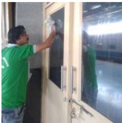
Before cleaning at Nanded station