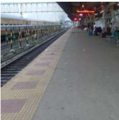
Before cleaning AWB station