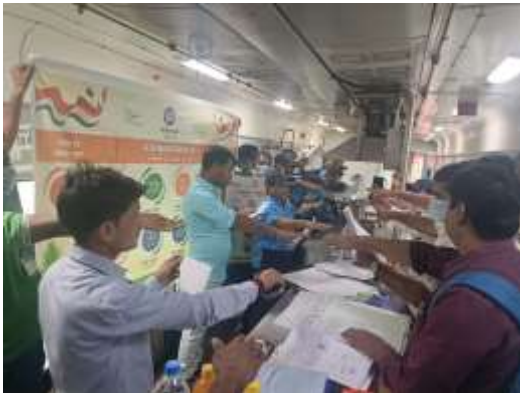
Awareness programme into the Suchkhand Exp Pantry Car followed by Swachhata pledge by CHI NED with SMR NED, CTI NED and other staffs.