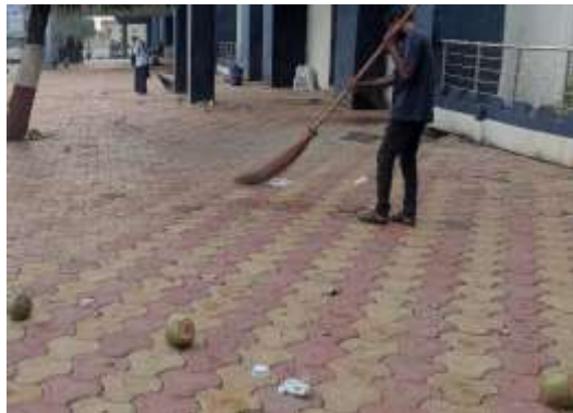
Before cleaning at JALNA station area

Swachh Parisar at JALNA station conducted by HI/J, SM/J and other staff