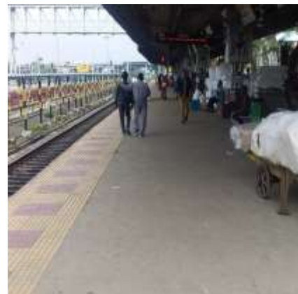
After cleaning AWB station