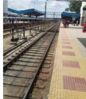
After cleaning at AWB Station